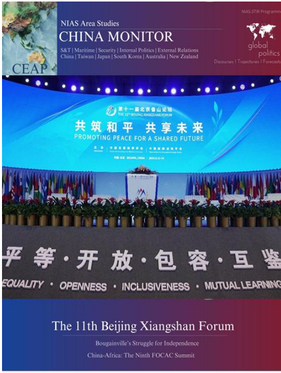
China Monitor, Vol. 01, No. 07, October 2024