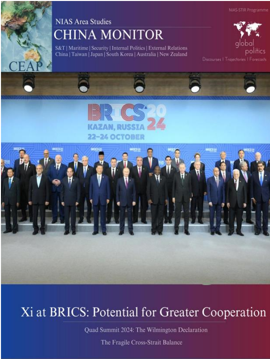
China Monitor, Vol. 01, No. 08, November 2024