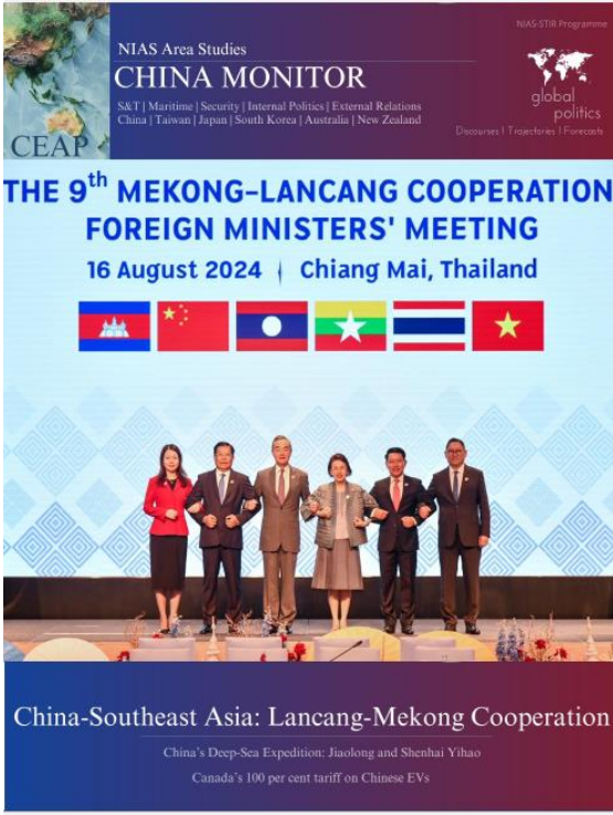
China Monitor, Vol. 01, No. 06, September 2024