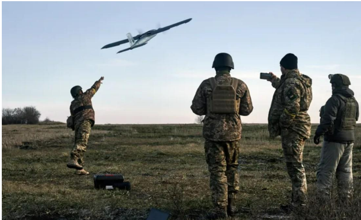
(Ukrainian soldiers preparing to launch a drone at Russian fronts near Bakhmut.)

Conflict Weekly #178 | Vol. 04 | Issue No.22 | 01 June 2023