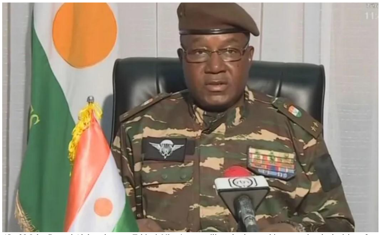
(On 28 July, General Abdourahamane Tchiani, Niger's new military leader speaking on national television after the coup.)

Conflict Weekly #186 | Vol. 04 | Issue No.30 | 27 July 2023