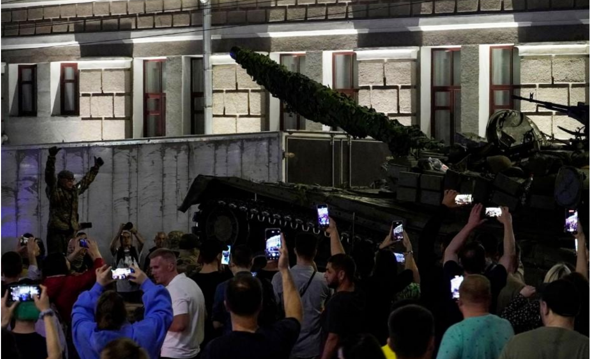
(Members of the Wagner Group preparing to pull out from Moscow to return to their base in Rostov-on-Don.)

Conflict Weekly #182 | Vol. 04 | Issue No.26 | 29 June 2023